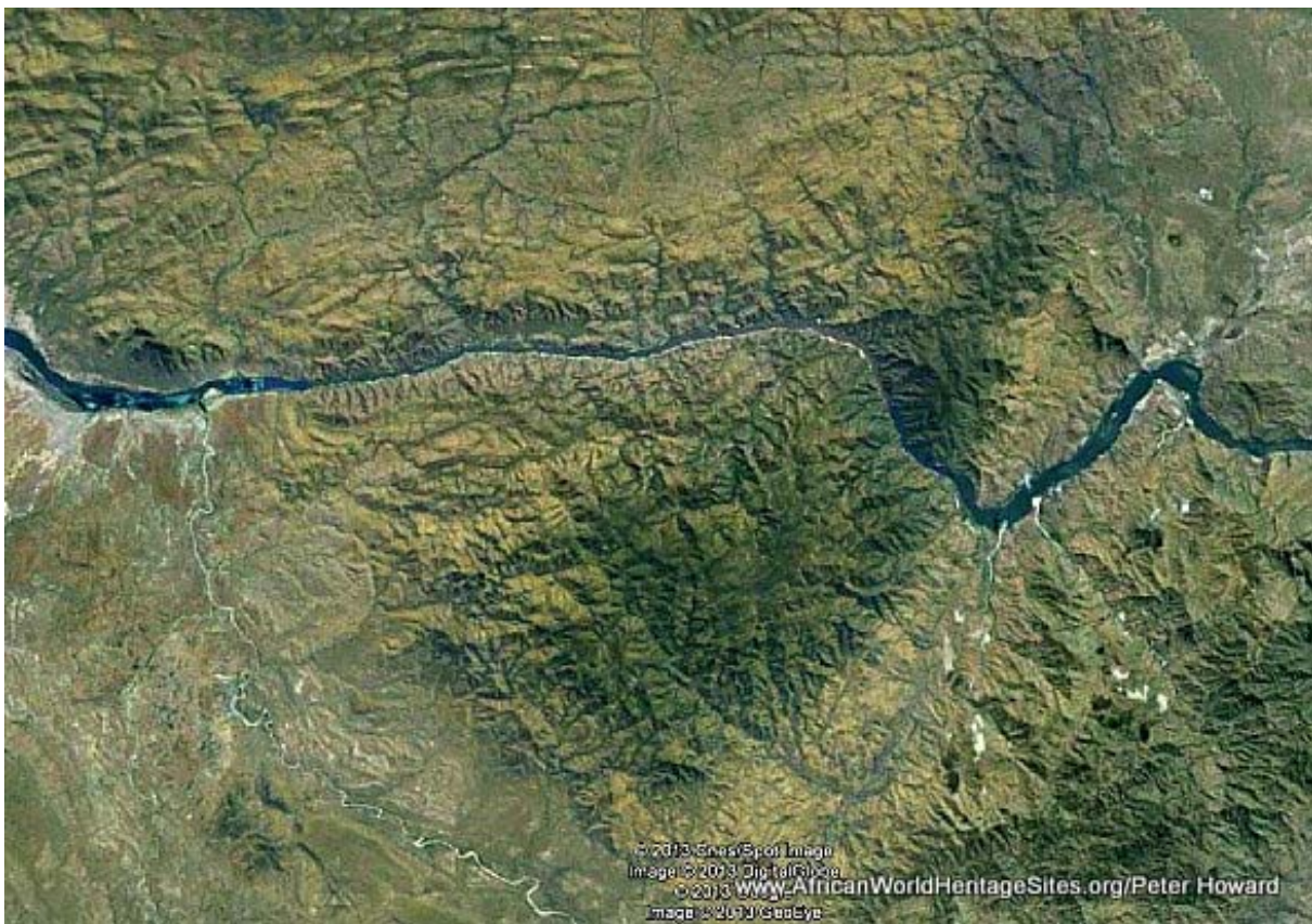
Google Earth satellite image of the hills and mountains on either side of the Zambezi River in the Mupata Gorge area, which has potential for construction of a major hydro-electric power facility that would flood the critical dry-season habitat of the middle Zambezi, and lead to a 50% reduction in the large mammal populations in the Mana Pools world heritage site.