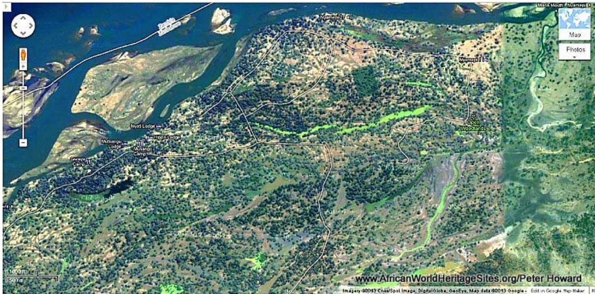
Google Earth satellite image of the central portion of the Zambezi River at Mana Pools National Park, showing the area of the park headquarters (centre top), the Mana and Chewure Rivers (right) and the motorable tracks and accommodation facilities in this part of the park.