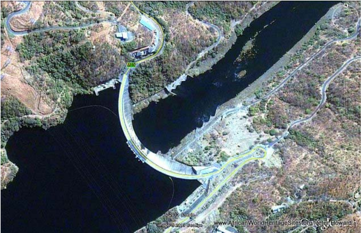
Google Earth satellite image of Kariba Dam (located upstream from the Mana Pools world heritage site) which has eliminated the natural cycle of flooding in the middle Zambezi and impacted the long-term ecology of the area.