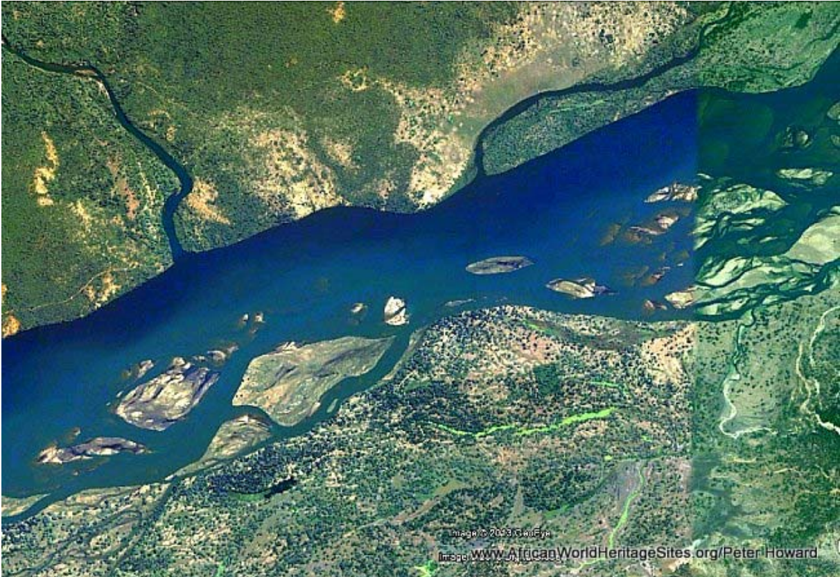
Google Earth satellite image of the central portion of the Zambezi River at Mana Pools National Park, showing the area of the park headquarters (centre), the Mana and Chewure Rivers (right) and the Zambian territory to the north of the river (top)