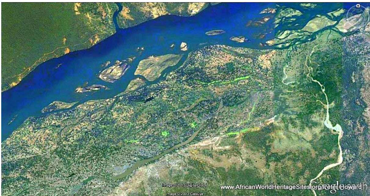
Google Earth satellite image of the central portion of the Zambezi River at Mana Pools National Park, the islands and sand-banks in the river, the area of the park headquarters (centre), the Mana, Chewure and Sapi Rivers (right) and the extensive floodplain (with Long Pool visible at its southern extent (centre, bottom)).