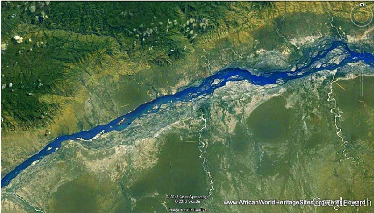
Google Earth satellite image of the middle Zambezi River valley, showing the main tributaries on the south bank, namely the Rukomechi (bottom left), Sapi (centre) and Chewore (right). The steep mountains of the north bank (Zambia) are visible (top), as well as large parts of Mana Pools National Park (lower left, between the Rukomechi and Sapi Rivers), and Sapi Safari Areas (lower right, between the Sapi and Chewore Rivers). Most of the Chewore Safari Area lies further east (to right of this image)