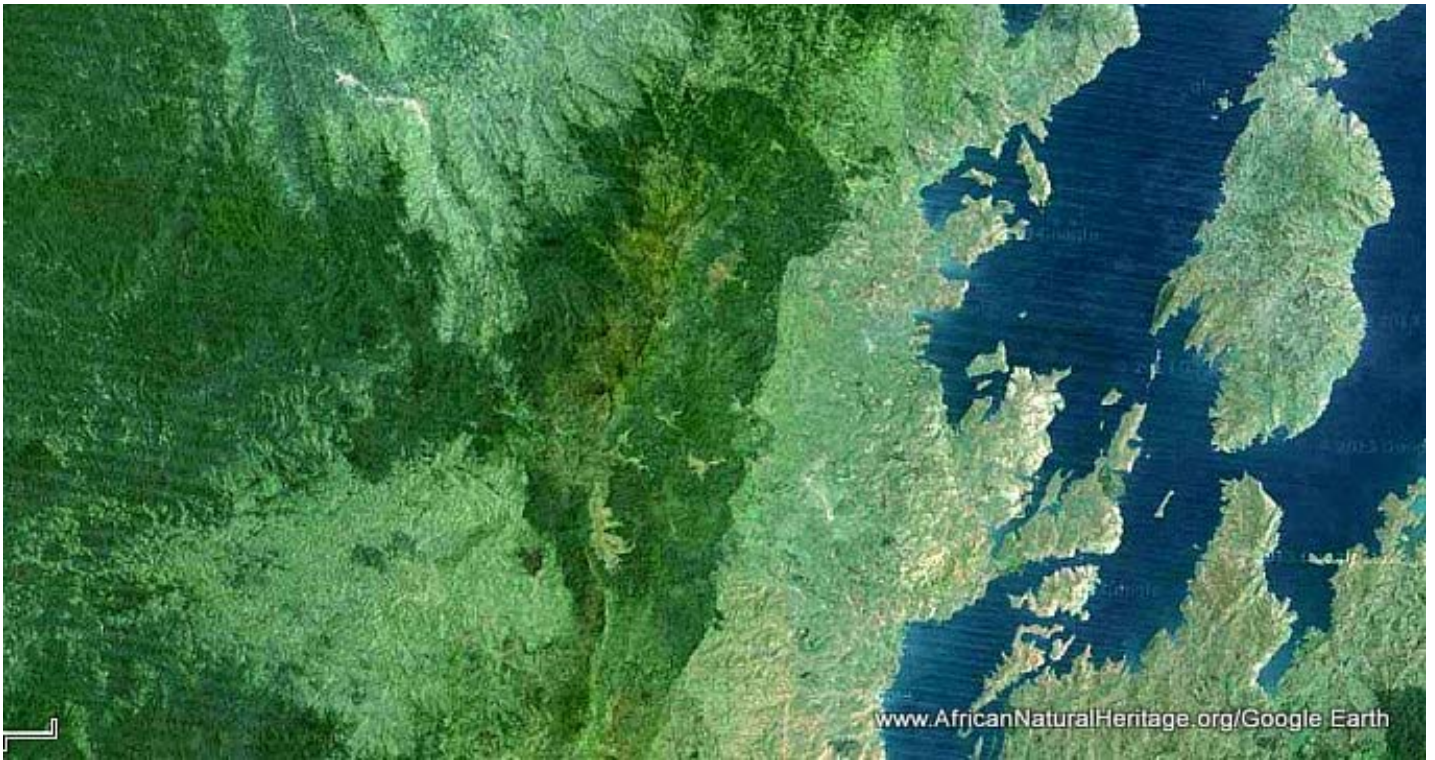
Google Earth satellite view of the ridge of mountains and associated forest that forms the 'old' highland section of Kahuzi-Biega National Park (World Heritage Site). Lake Kivu occupies the right side of the photo. Note the distinct boundary line, with little forest remaining in the cultivated lands outside the park (especially on the eastern (lake) side).