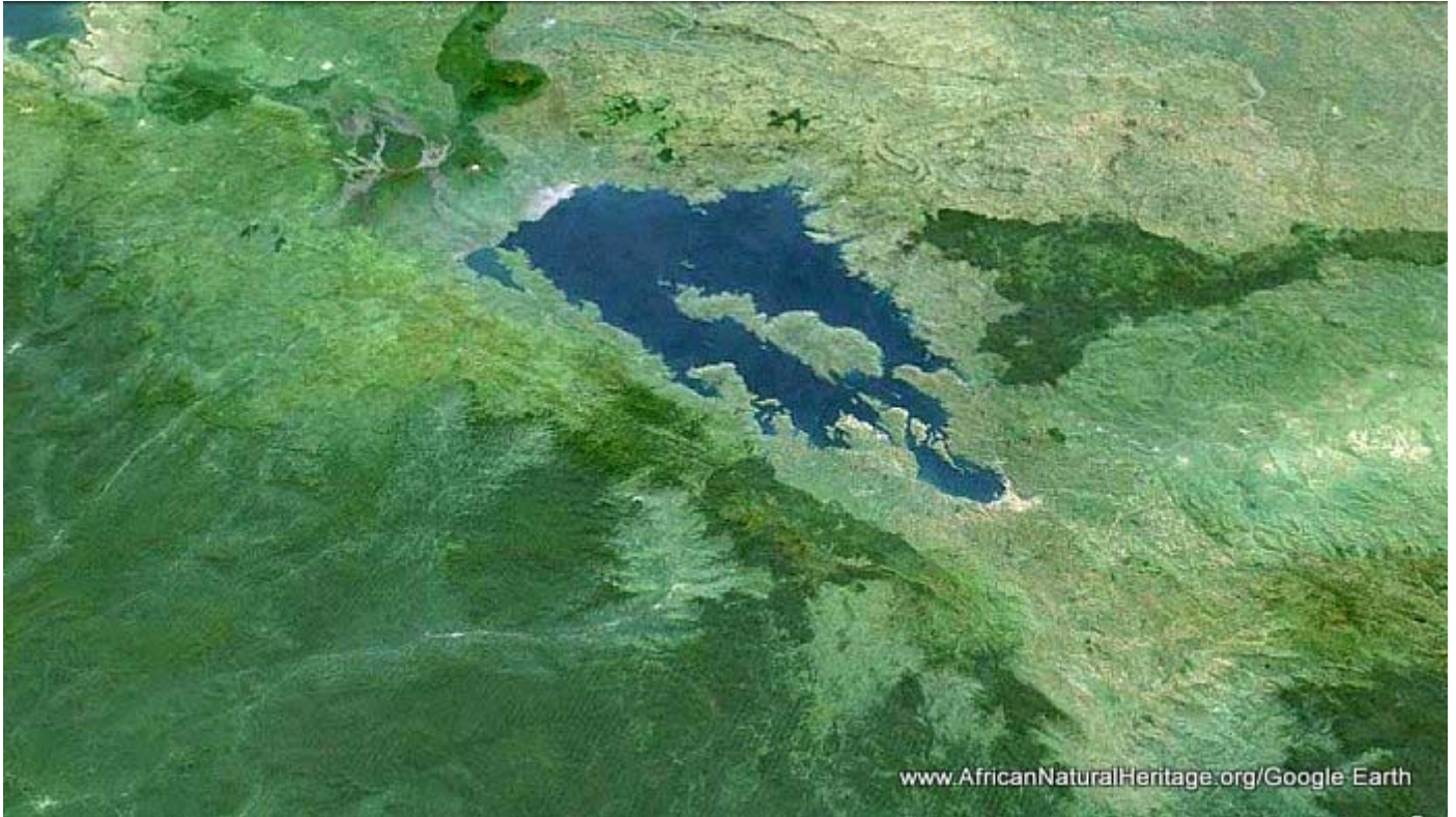
Google Earth satellite image of the central section of the western (Albertine) Rift Valley, viewed from the south-west, showing the southern shores of Lake Edward (top left), part of Virunga National Park, Lake Kivu (centre) and the Nyungwe-Kibira Forest on the far side of the valley (middle right). The montane section of Kahuzi-Biega National Park, the corridor and some of the lowland forest section are shown in the foreground (centre).