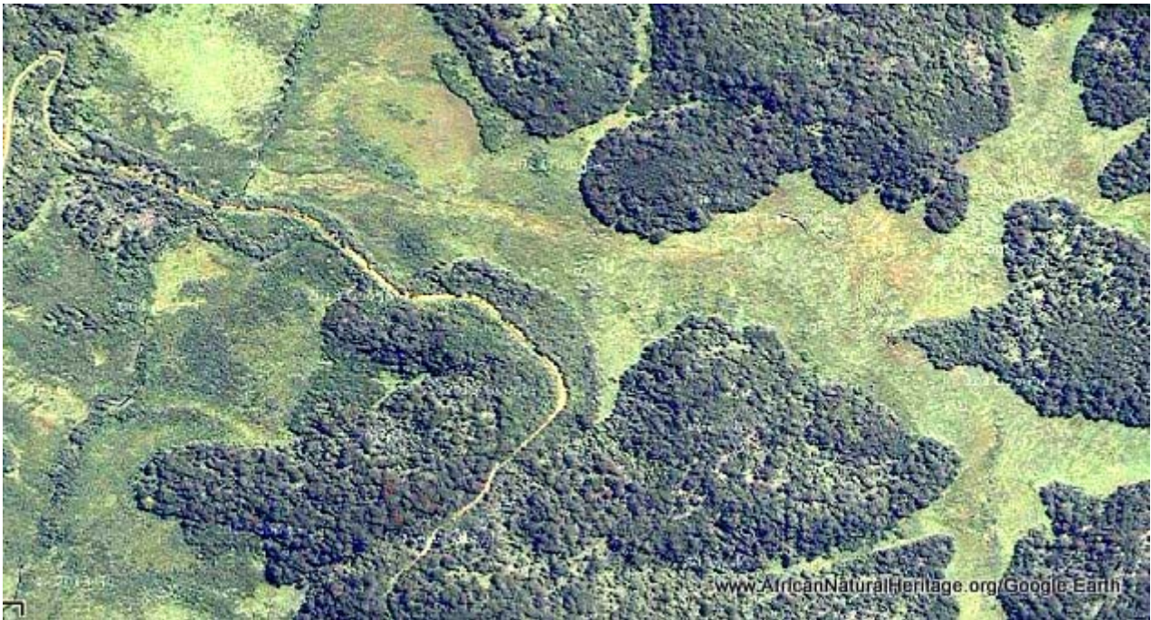
Satellite image of the main upland swamp, showing the course of the main road through the park, and the forested slopes of surrounding hills.