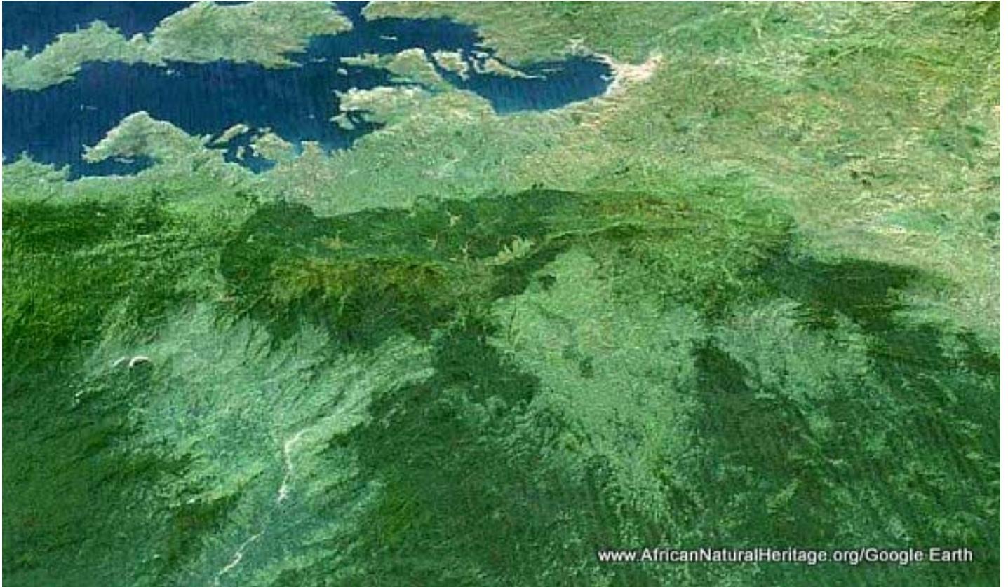
Satellite view of the upland portion of Kahuzi-Biega National Park from the west, with Lake Kivu behind. The prominent peaks of Mounts Kahuzi and Biega can be seen (centre) as well as the narrow forested corridor linking the upland portion to the lowland part of the park (right).