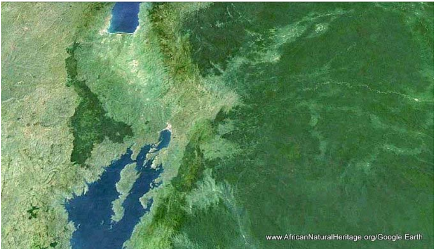
View of a portion of the Rift Valley looking south, with Lake Kivu in the foreground and part of Lake Tanganyika in the distance (top). The lowland forests of the Congo Basin occupy the western half of the image (right), while the Rift Valley is flanked by the Nyungwe-Kibira forest complex of Rwanda-Burundi (east, centre left of image), Itombwe Forest (top, north-west of Lake Tanganyika), and Kahuzi-Biega National Park (foreground, centre and right).