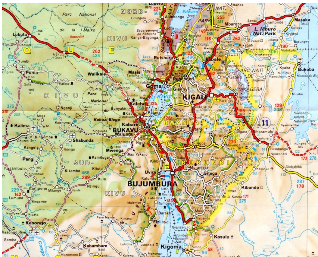
Road map of the region around Kahuzi-Biega National Park (Michelin Sheet 746)