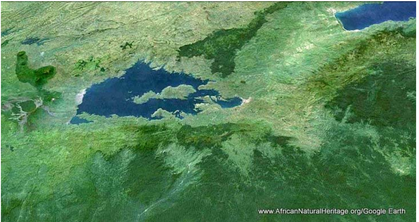
Satellite view of the central section of Africa's western (Albertine) Rift Valley showing the Lake Kivu basin including (clockwise from left) the southern end of Virunga National park (extreme left), Lake Kivu (centre), Nyungwe and Kibira Forests (top centre), the northern end of Lake Tanganyika (top right), Itombwe forest (mid-right) and the highland ridge and forested western slopes of Kahuzi Biega National Park (centre foreground).