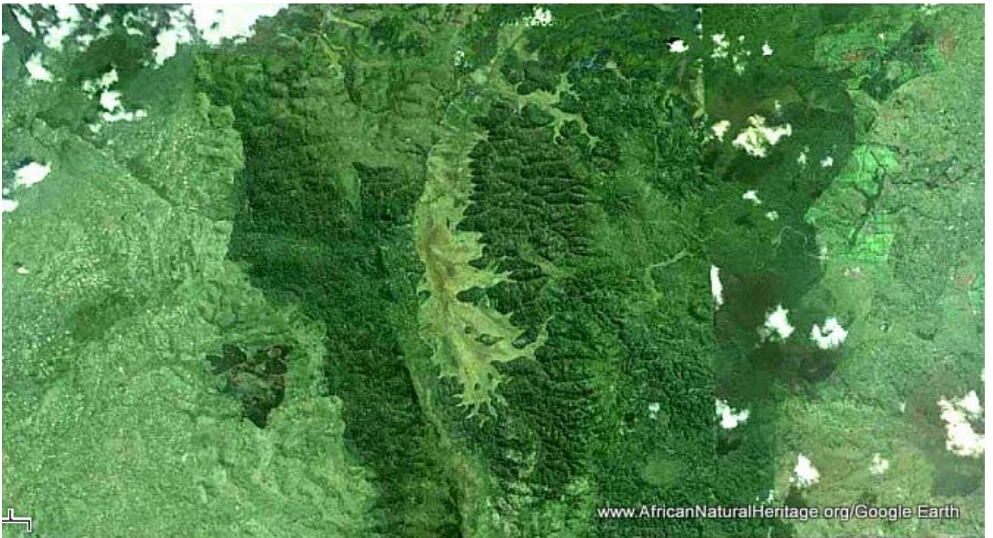
Google Earth satellite image of the central portion of the upland section of Kahuzi-Biega, showing the route of the main road from the eastern boundary of the park (near park headquarters at Tshivanga, centre right) as well as the drainage into the main swamp. Mount Kahuzi is located just north (centre top, just out of view) of the swamp, while Mount Biega lies to the south (bottom, also just out of view).