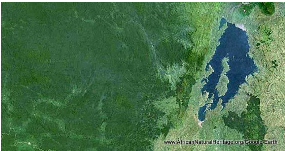
Satellite view of Kahuzi-Biega National Park with Lake Kivu and Rwanda's Nyungwe Forest to the east (bottom right)