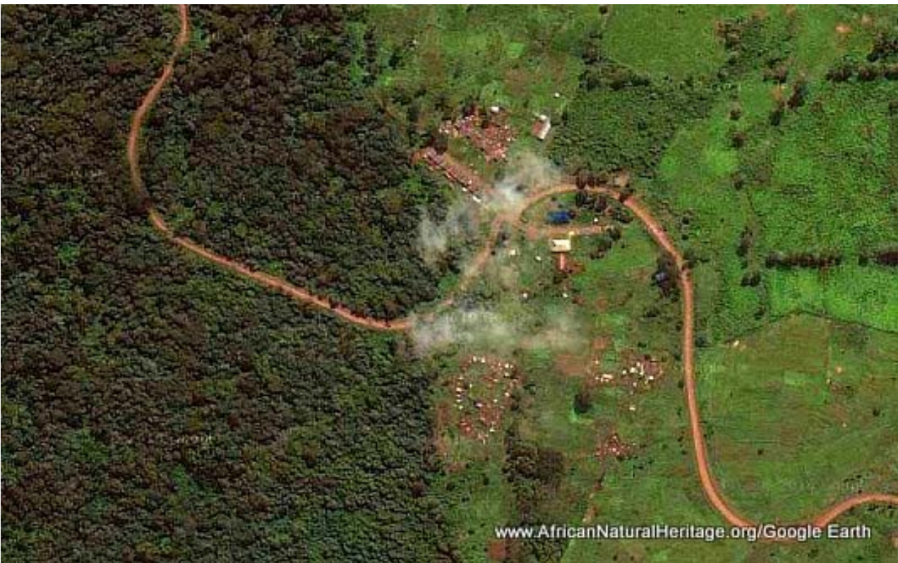
Satellite image of the eastern boundary of the upland section showing the main road through the park and the administrative headquarters at Tshivanga. Land around the upland section of the park is becoming increasingly settled and cultivated, creating a 'hard' boundary between protected forest and the cleared land surrounding it.