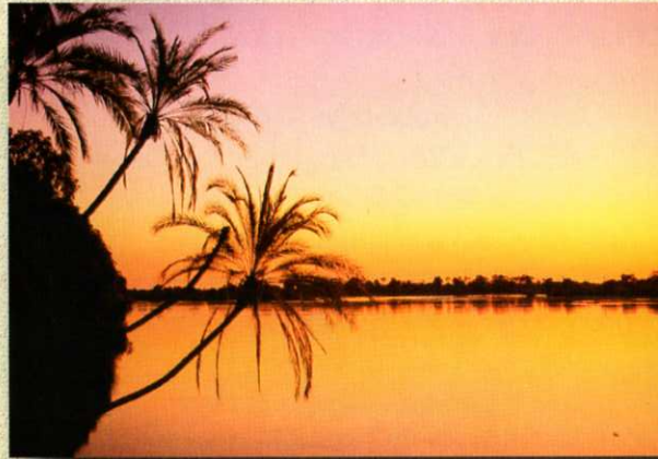
Sunset on the Zambezi River.

Marvelling at the splendour of Victoria Falls is, of course, the prime activity of the area. Visitors should plan on viewing the Falls at several different times, as the ever-changing mist and light can afford spectacularly different views throughout the day. Moonlight viewing is an unique