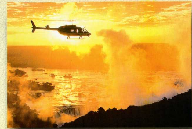
Helicopter flight over the magnificent Victoria Falls.

opportunity which takes place during periods of the full moon. Game-viewing, fishing and many different types of river activities are sure to provide days of enjoyment. The Victoria Falls Publicity Association is situated in the centre of town where staff are happy to provide up-to-date information on all aspects of touring activities. Information available includes: hotels and other accommodation; guided tours; river cruises; bungee jumping; whitewater rafting; helicopter and microlight flights over the Falls; game-viewing and