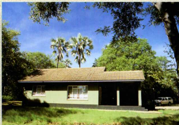
One of Zambezi National Park's Lodges.

only during the dry season between 1st May and 31st October. Kandahar is open throughout the year. Exclusive bookings may be made for a party of up to ten persons. Facilities consist of a flush toilet and cold shower, tap water, a sleeping shelter (with low side walls at Kandahar), cement table with bench and braai unit. Firewood can be purchased at the reception office but, as supplies are limited, it is recommended that visitors bring their own means of cooking. These areas are not serviced and visitors are requested to leave the camps in a clean and orderly condition. Power boating is permitted above Kandahar Island and limited to two boats per camp. Fishing by boat is excellent in these areas.