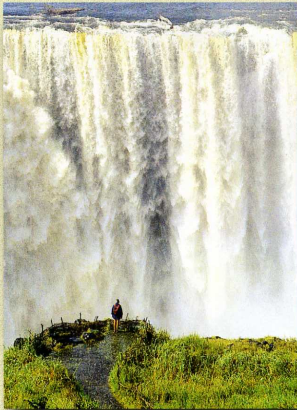
Admiring the Falls from one of the rainforest viewpoints.

Upstream along the Zambezi River drive there are twenty-five numbered sites where day visitors may picnic or fish. These sites are attractively situated on the banks of the river and sheltered beneath the beautiful shady riverine vegetation. No licences are required, however fishing is only permitted at designated areas. Visitors are requested to be aware of their surroundings and remove all traces of their presence before leaving.