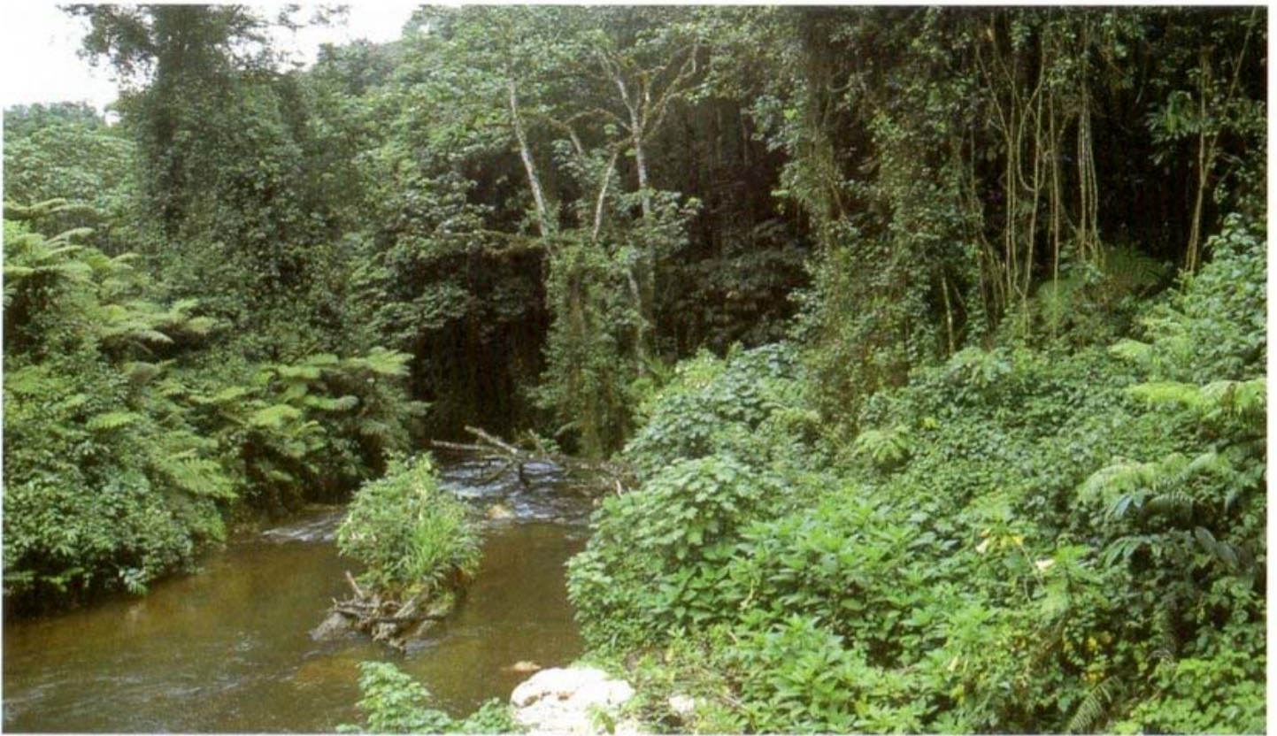
At the bridge over the Ihihizo River, look for Long-tailed Wagtail and the uncommon Cassin's Grey Flycatcher.