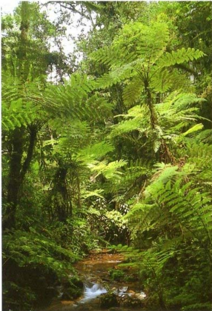
The lush rainforest at Buhoma is home to many Albertine Rift endemics.

A wide, gently undulating track runs south of Buhoma through excellent forest towards Nteka, allowing views of the canopy and forest edge. Thicker vegetation along the first few hundred metres is home to Equatorial Akalat and Olive Long-tailed Cuckoo whilst a mixed, canopy flock containing Dusky Tit and the scarce Oriole-Finch