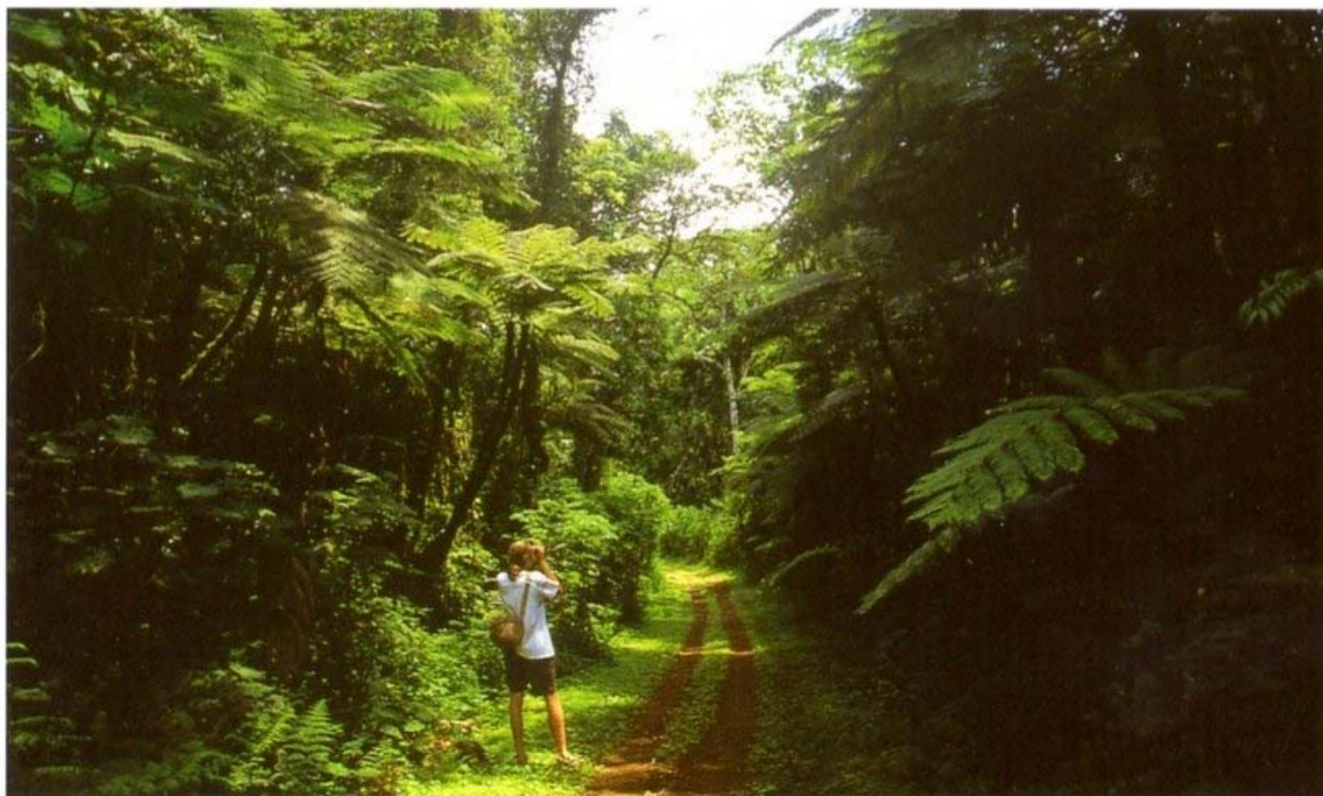
The wide trails around Buhoma offer some of the very best forest birding in Africa.

Amongst these are some of Africa's most enigmatic and sought-after birds such as Congo Bay-Owl, African Green Broadbill and Yellow-crested Helmet-Shrike. Whilst a slightly higher proportion of endemics may be found in the Congolese mountains and in the extensive Nyungwe Forest of Rwanda and Burundi, current political instability in these neighbouring countries makes southwestern Uganda the best place to search for these special birds. Of the 26 Albertine Rift endemics occurring in Uganda, 24 may be found in the magnificent Bwindi-Impenetrable NP. Other productive sites include Rwenzori and Mgahinga Gorilla NPs, supporting 19 Albertine Rift endemics each.