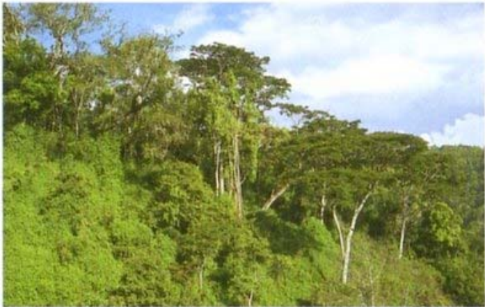
Superb montane forest at Ruhizha.

ising constantly from nearby pine trees during the breeding season) and Stripe-breasted Tit (nesting in boxes erected in trees along the road to the ITFC). The rare Fraser's Eagle-Owl and Red-chested Owlet may be heard at night although African Wood Owl is the only owl likely to be seen. Montane Nightjars (sometimes considered a separate species, Rwenzori Nightjar) vocalise at dawn and dusk and may be seen along the road towards Buhoma or occasionally in the Guesthouse clearing itself.