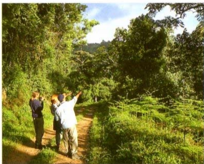
Easy birding in one of the richest forests in Africa.

see, many species associating in mixed feeding flocks that are active throughout the day (but with a peak of activity in the mid-morning).