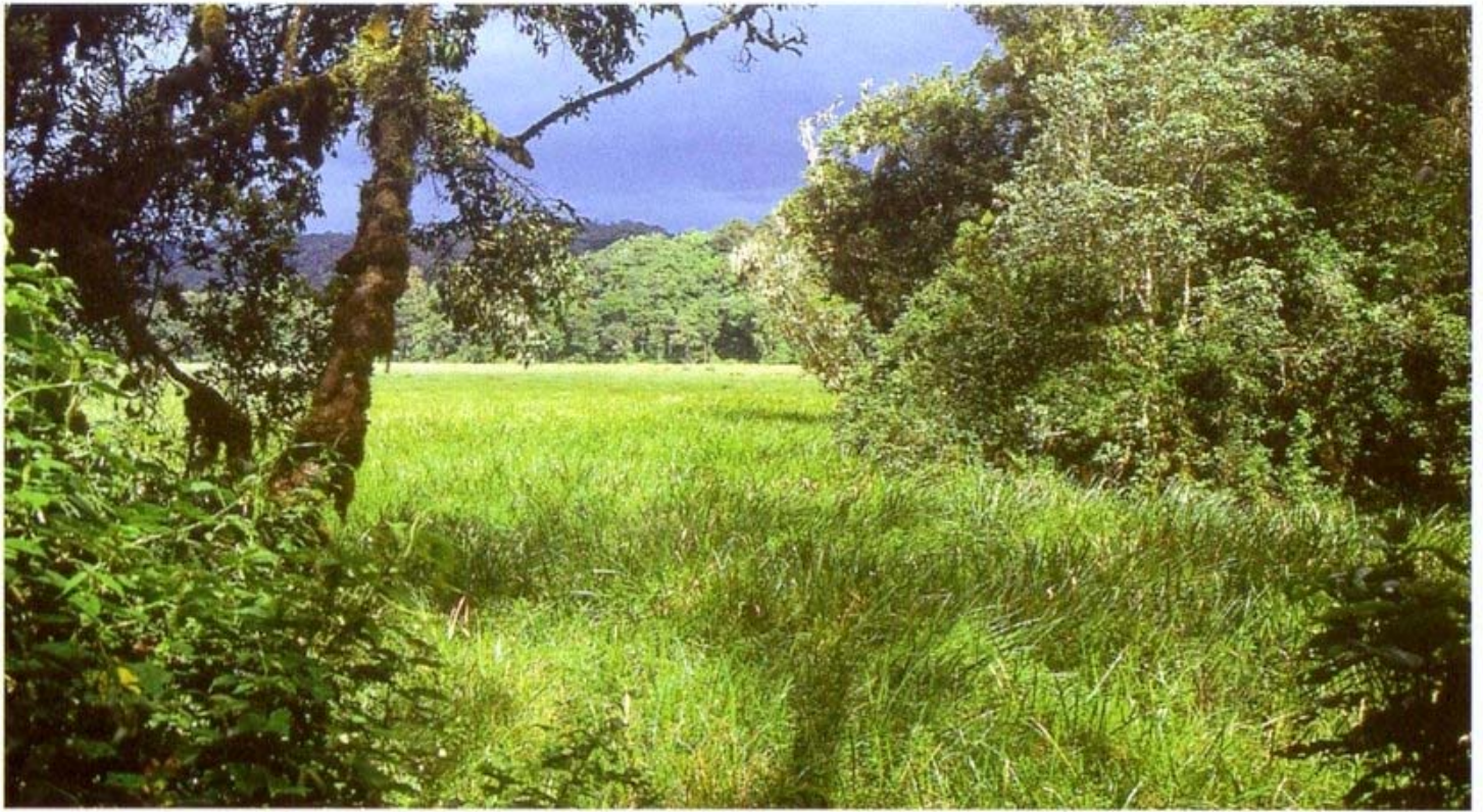
The large Mubwindi Swamp is home to Carruthers' Cisticola and the localised Grauer's Rush Warbler.

at fruiting trees in this area include Great Blue and Black-billed Turacos, the spectacular Yellow-billed Barbet, Montane Oriole and Waller's Starling. Search the forest along the muddy trail to the edge of the swamp for Bar-tailed Trogon, White-headed Woodhoopoe, the beautiful Grey-chested Illadopsis, Pink-footed Puffback and Lagden's Bush-Shrike. Carruthers' Cisticola and the localised Grauer's Rush Warbler are both common and conspicuous in Mubwindi Swamp, particularly when engaged in breeding displays. Red-chested Flufftail may also be heard calling from the swamp although seeing one requires a combination of luck, patience and a tape recorder.