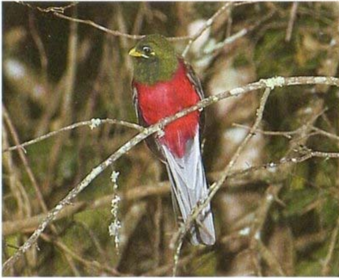
Narina Trogon is more often heard than seen.